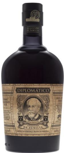
SELECCIÓN DE FAMILIA