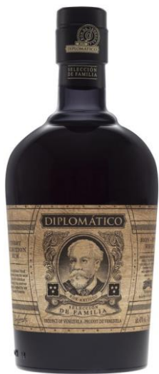
SELECCIÓN DE FAMILIA