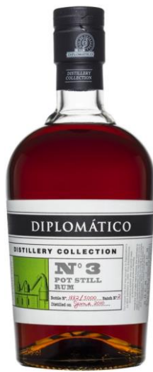
NO.3 POT STILL