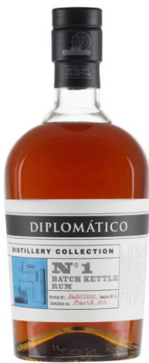
NO.1 BATCH KETTLE