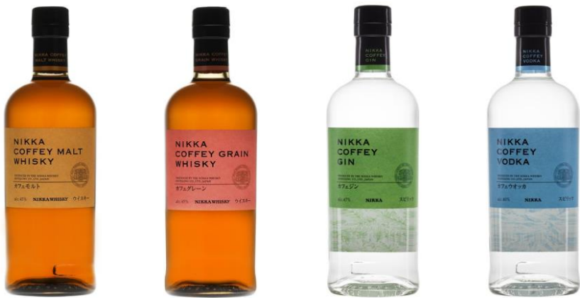
NIKKA COFFEY MALT