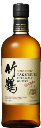
NIKKA TAKETSURU PURE MALT